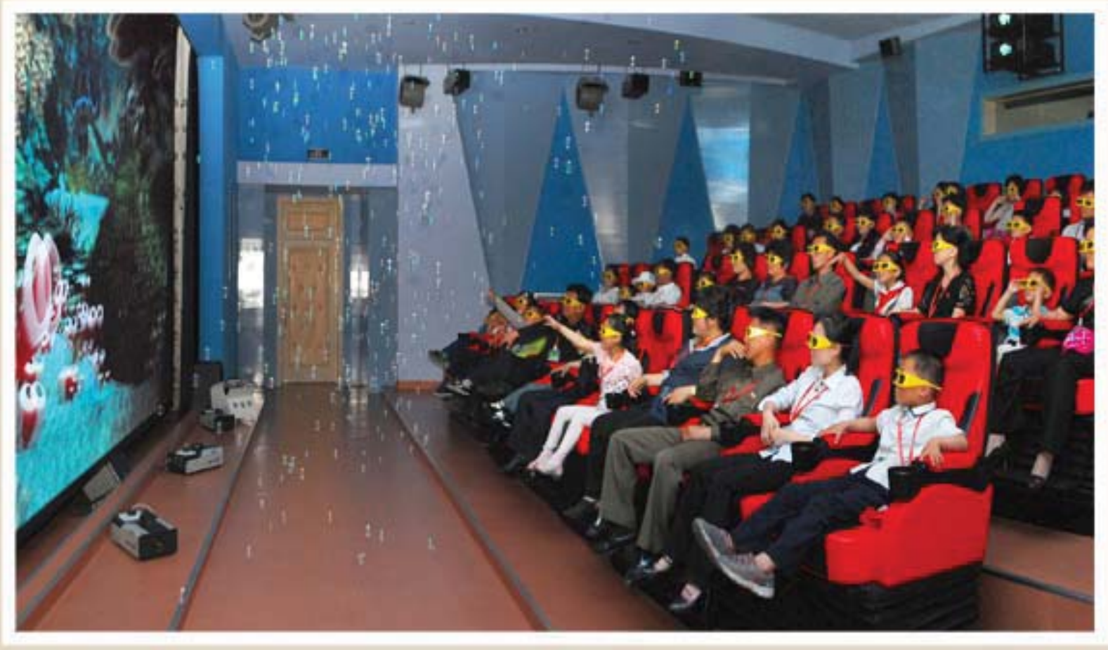
4D simulation cinema